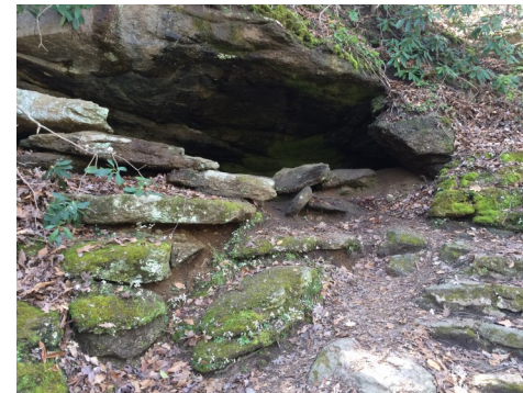
Smaller of three caves near Yadkin River.

In 1750, Squire Boone left Pennsylvania to bring his sizable family to the fertile Yadkin Valley of North Carolina. Among the group was his son, 16-year-old Daniel Boone. Local legend has long held that the Boones spent their first year in North Carolina at or near the site of the present day Boone's Cave Park. Popular local stories tell of Daniel Boone and perhaps his family using the cave above the river for various purposes.